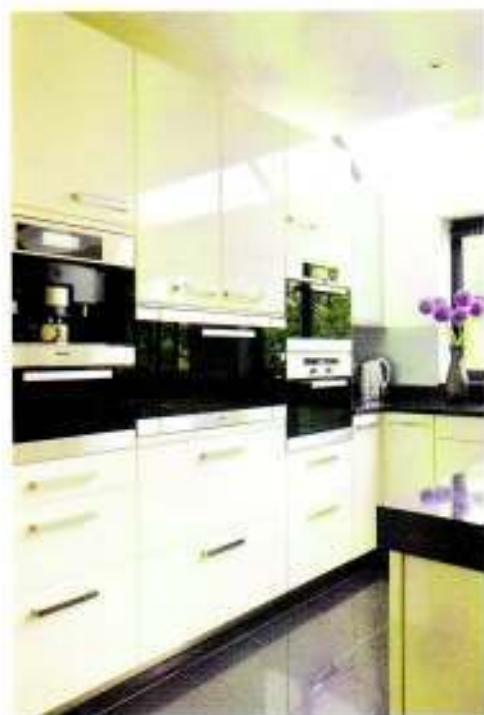
above State-of-the-art appliances are housed within an almost symmetrically designed bank of units, allowing tasty treats to be created with ease.