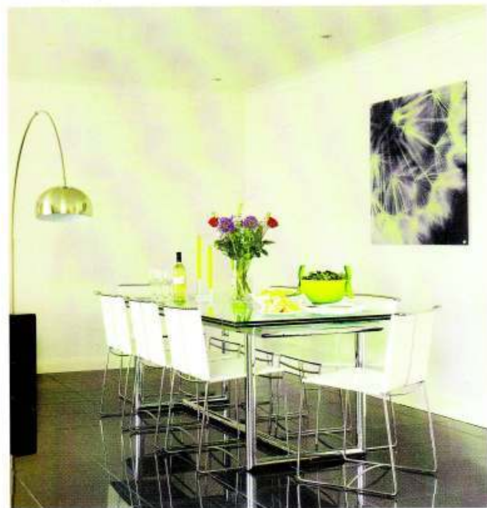
below In the Italian-inspired dining area, a smart glass-topped table is teamed with slim white and chrome chairs for special family mealtimes.

Both Linda and her daughter, Emma, share a passion for interior design and spent a great deal of time finding various solutions together, along with MICasa Interiors who were on hand to develop and source window dressing and soft furnishings. "Our weekends were taken up by researching all sorts of items and we would go on long dog walks to look at ideas for windows, drives, front doors and even guttering. We also visited showhomes to see new trends. I even kept a folder subdivided into sections for each room and a sample box full of paint tester pots, tiles and fabric swatches," Linda admits. "The team at MICasa were really fantastic. They made all the bespoke curtains, headboards and blinds, as well as helping me bring to life concepts that I had of my own," she enthuses.